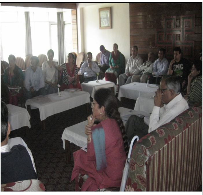
NCPCR team interacting with the civil society organisations (CSOs)/NGOs working in areas of child rights in the State

The following issues emerged during the discussion with the CSOs /NGOs: