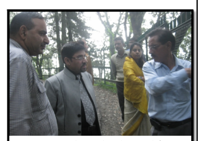
NCPCR Team at the site where the two girls from a reputed school reportedly committed suicide

I. Commission had taken cognizance of the matter regarding alleged physical and mental torture of two girl students of Class VI in Convent Jesus &Mary School, Shimla (which has allegedly led to their mysterious death). Commission issued notice for all the concerned Officials of Education Department, Police Department and School Authorities to appear before the Commission in the month of January 2013. Post proceedings, the Commission has sent certain recommendations to be acted upon by the Department of Home and DGP, State Education Department (including the Directorate of