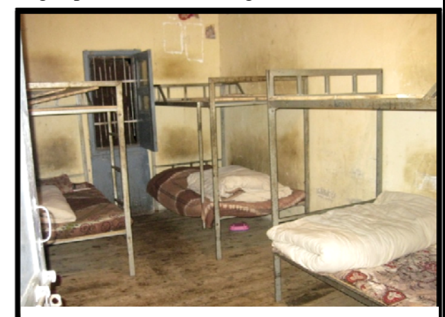
The dull rooms with discoloured walls

There were 54 children residing at the home. Some children had gone home for the vacations. The children are in the age group of 14-18 years studying in class 9 to 12<sup>th</sup>. The premises were clean with a large quadrangle